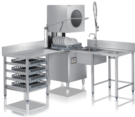
Corner Installation (R → L)