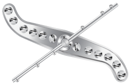
“S-shaped” Wash Arms