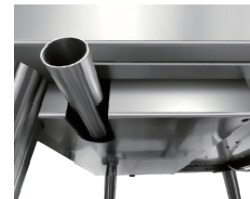
Auto Drain System