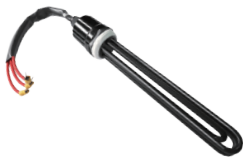
SUS 316L Heater (Special Coating)