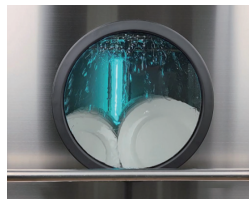
Ultraviolet (UV) Lamp