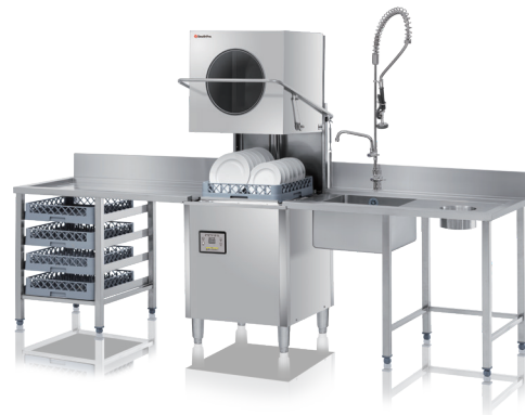
Straight-through Installation (R → L)