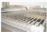
Rod grill grate