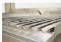
"Y" grooved grill grate