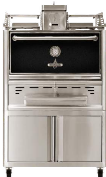
Cabinet Base Version