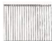
Upper grill rack