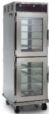
HC 15 with glass door and CDT Control

Capacity 5 Tray (457 x 660 mm) Dimension 628 x 806 x 953 mm Volt. 240/1/50 E. Pow. 1.61 kW (EM) / 1.59 kW (CDT) Thermostat 71 – 99°C