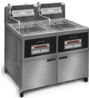
OFG 342 C8000