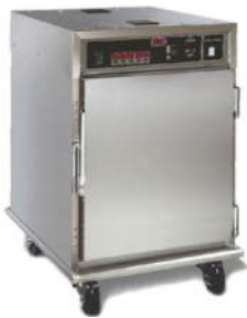
HC 5 with solid door and CDT Control

Fully insulated cabinet and tight-sealing door help you enjoy the benefits of high quality holding while using very little energy. Many operators see a net reduction in overall kitchen energy costs. Partial pan removal, self-closing door and magnetic closures contribute to convenient work flow and energy savings.