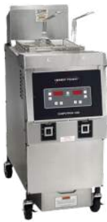
OFE 321 C1000