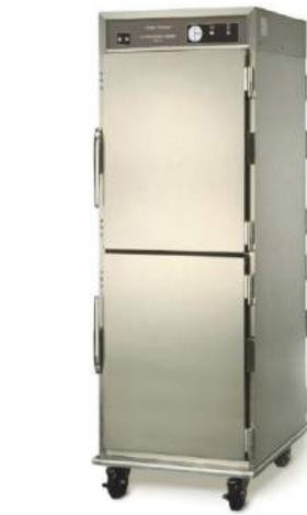
HC 15 with solid door and EM Control

Capacity 13 Tray (457 x 660 mm) Dimension 628 x 806 x 1810 mm Volt. 240/1/50 E. Pow. 1.61 kW (EM) / 2.09 kW (CDT) Thermostat 71 – 99°C