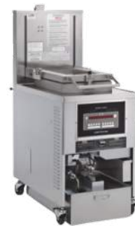
OFG 391 C8000