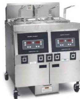
OFE 322 C1000