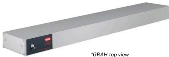
*GRAH top view