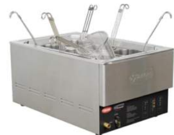
RCHTW Pasta Cooker Adapter Set