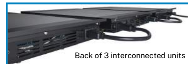
Back of 3 interconnected units

Hatco's patented Palletti® Countertop Professional Induction Warmers offer a safe, efficient and attractive way to keep hot foods hot. Perfect for serving applications such as buffet lines and hospitality suites. The warmer has five simple and precise settings, which allow for a wide variety of foods to be held both safely and at optimum quality. The units are also memory retentive, so once turned off and back on, the last setting will resume. This unit has a low-profile and ultra-thin design in all black, so the focus remains on the food rather than the equipment.