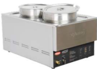
RCHTW Soup Kettle Adapter Set