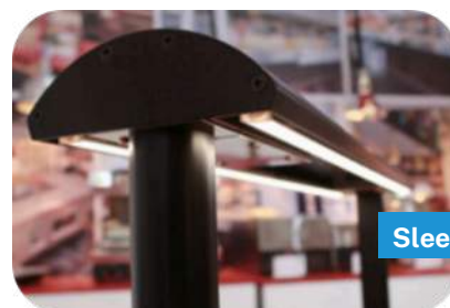
Sleek Curved Design

*picture shows GM5AHL series with lighting