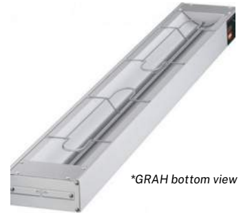
*GRAH bottom view