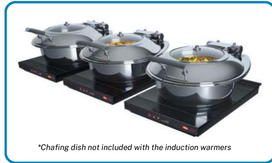
*Chafing dish not included with the induction warmers

Countertop Induction Warmer Dimension 330 x 450 x 57 mm Volt 230/1/50, E. Pow. 0.50 kW