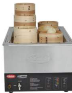
RCHTW Steamer Plate Adapter Set