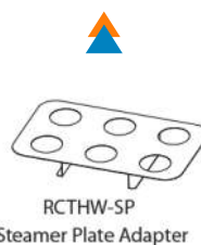
RCTHW-SP Steamer Plate Adapter