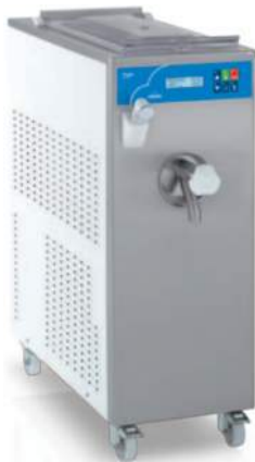
Pasto 30 XPL