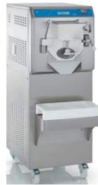
Labo 20 30 XPL P