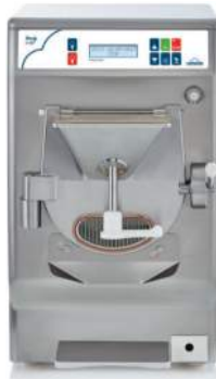
Ready 14 20