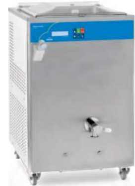
Pastomaster 120 XPL P