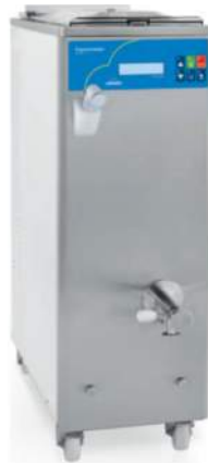
Pastomaster 60 XPL P