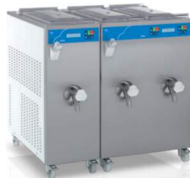
Age XPL Series