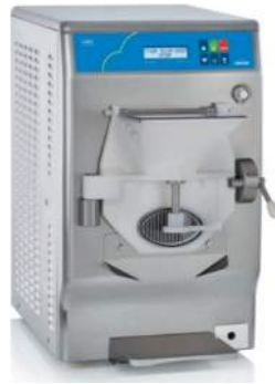
Labo 14 20 XPL P