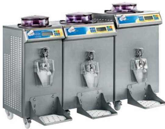
Pastochef RTL Series