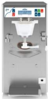
Ready 8 12