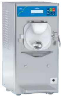
Labo 8 12 XPL P

Carpigiani has all the ice cream equipment you will need!