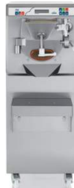
Ready 20 30