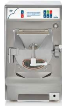
ReadyChef 14 20